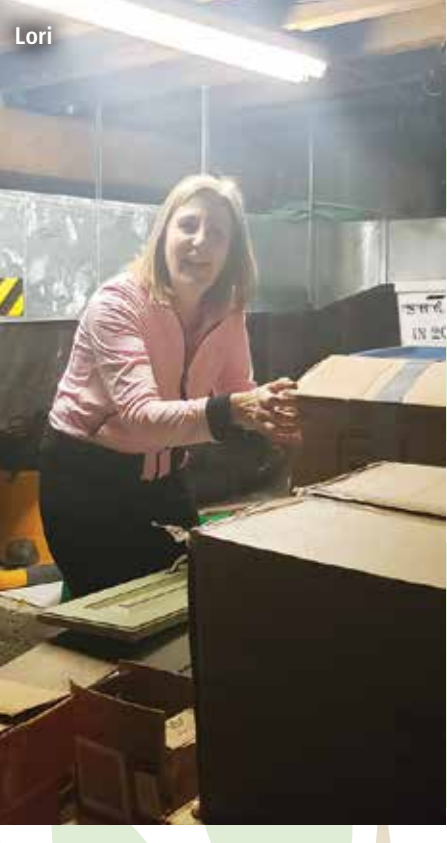
DID SOMEONE SAY CLEANING?